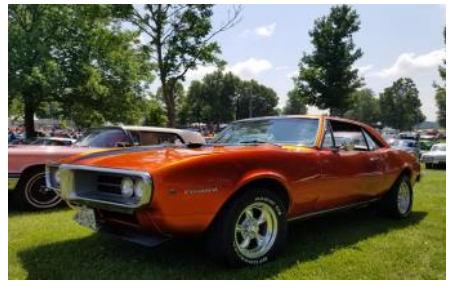
Beldenville Old Car Show Sunday July 24<sup>th</sup> 6am – 12pm

We will be selling concessions from Our Savior's Church stand at the fairgrounds for both events!