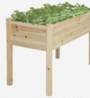
Planter box similar to this