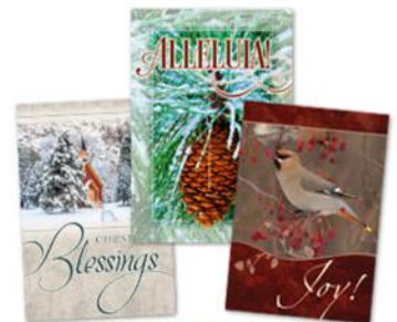
CHRISTMAS CARD VARIETY CARTON

Thank you for supporting our 2023 Mission Trip!